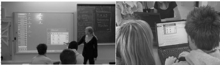
Figure 6 - eBags in use across technologies

The eBag provides a flexible infrastructure for students and their teachers across different technologies, including all the other prototypes. It supports differentiated education because it is personalised, and serves as a digital portfolio as well as a communication tool between the teacher and the students.