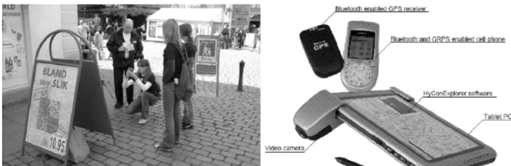
Figure 2 - The HyConExplorer prototype pack and the HyConExplorer in the field

We have been inspired by a number of projects that aim to move education out of the classroom. Gay et al. (2002) present some interesting pedagogically founded perspectives on how mobile technology may support the natural science subjects in the field, e.g., data gathering and cooperative learning. However, they do not consider how context specific information and services can support field-work. Ambient Wood (Rogers, et al. 2005) is another fine example of how we may move education out of the classroom. Their goal was to provide pupils with: “ contextually relevant digital information during their explorations of the woodland at pertinent times that would provoke them to reflect and discuss among themselves and the facilitators its significance and implications for what else was around them. ” (Want, et al., 1995 p. 45) We agree with the importance of supporting reflected learning but we also see a great need and great possibilities in supporting constructive contextual feedback from the pupils, allowing them to produce material tied to the current activity and location. Providing teachers and pupils with tools of contextualization is thus essential to support the learning process in the field and project based education in general.