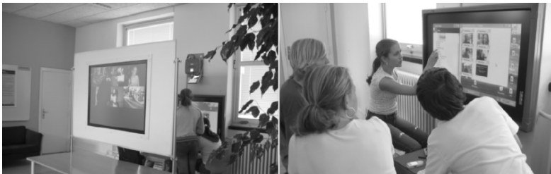
Figure 3 – the eCell from without and within

the many expenses connected to moving away from home. They save the plan and the brainstorming notes in their project folder, and the group leaves the eCell. During their work with the project, the group use the eCell on several occasions, and they start posting some of their project material on the outer screen to inform the rest of the school of what they have been up to. The publication of the project material provides the group with new input about the project theme from other students and teachers who have been watching their progress on the public screen of the eCell.