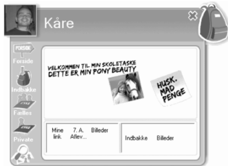
Figure 5 - an open eBag

of mobile technology is, naturally, not limited to use outside. Ogata & Yano (2004) presents JAPELAS (Japanese polite expressions learning assisting system), a context-aware system to help learners choose the correct form for addressing other people in-situ based on information about the social hierarchy. Common to these examples and a parallel to our work is the understanding that ubiquitous learning requires the seamless support of learning activities across technologies, social settings and physical locations.