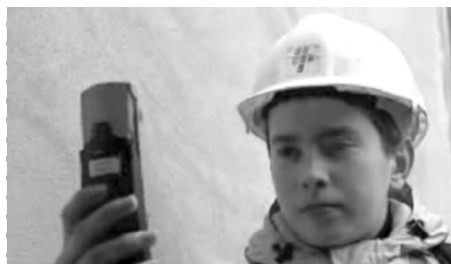
Figure 1 - school work in the field

As described above, it is becoming didactically desirable as well as technically possible to move school work outside of the classroom, and take advantage of the rich sources of information available beyond books and computer screens. It is, for example, possible to read a book about construction work and gain basic knowledge of what constitutes working at a construction site, but the book has no way of conveying how work is coordinated, how noisy the environment is, how safety is ensured through the action of the workers, etc. Taking a field trip to a construction site is a much richer source of information if we wish to properly grasp the working conditions (Figure 1).