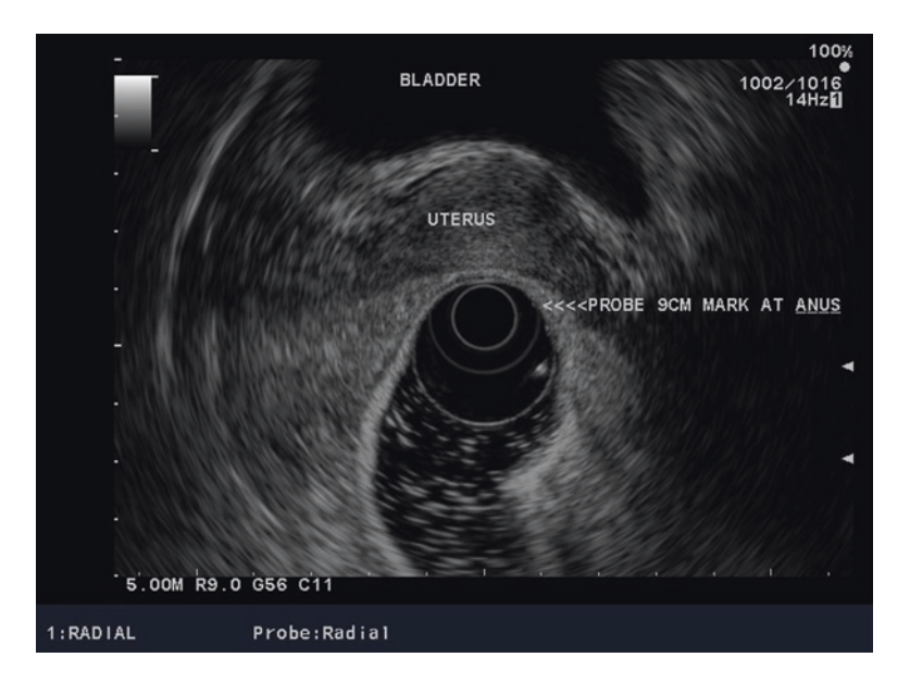
Fig. 3. Female rectum: 9 cm proximal to the anus with the uterus immediately anterior and the bladder deeper to the rectal wall. These structures can be oriented along the top of the screen to establish the anterior reference for the remainder of the exam.