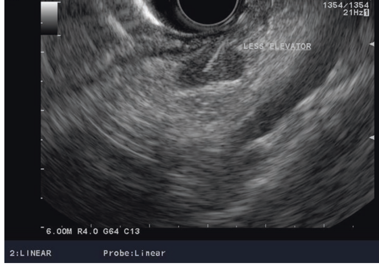
Fig. 4. (a) Targeting lesions: Note the angle between the center of the EUS probe and the needle. This angle is influenced by variables, including the depth of scope insertion, degree of tip deflection toward the target, and the amount of elevator deflection on the needle sheath. (b) Mediastinal node sampling with less tip deflection toward the target and less elevator pressure on the needle sheath. (c) Same mediastinal node but sampled with more tip deflection toward the target and more elevator pressure on the needle sheath. (d) Bent FNA needle sheath resulting from more elevator pressure in targeting a lesion.