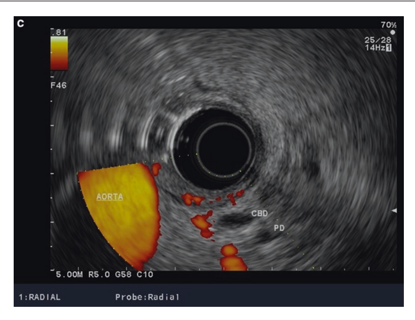
Fig. 2. (continued)