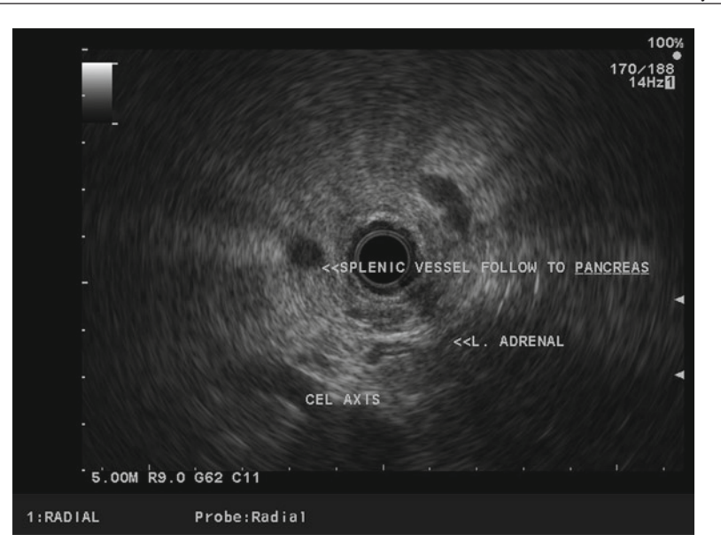
Fig. 1. Proximal stomach: aorta and celiac axis (cel axis) situated posteriorly. From this position, pushing slightly and angling the scope tip along the posterior wall of the stomach will bring the splenic vessels and body of the pancreas into view. The splenic vein is oriented along the inferior margin of the pancreatic body and tail.

(4) Rectum at \sim 7–9 cm insertion revealing the prostate in men and at \sim 9–11 cm insertion revealing the uterus in women (Fig. 3).