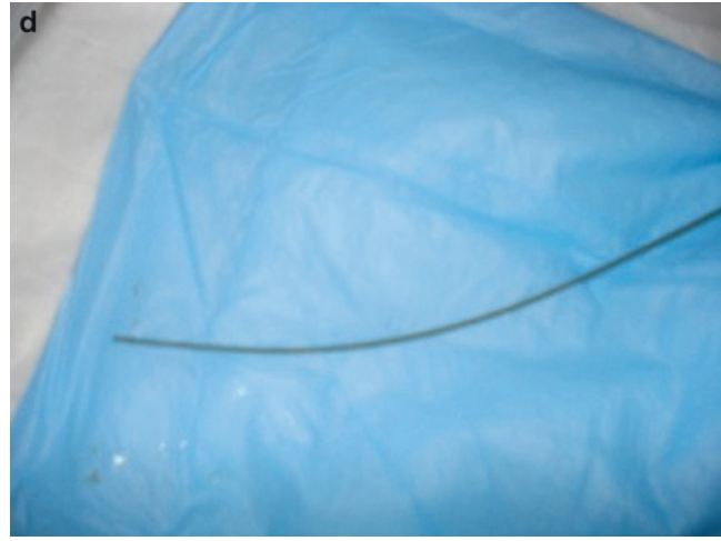
Fig. 4. (continued)

In order to mitigate the nondiagnostic pitfalls of FNA, form a good working relationship with cytology staff. It has been clearly shown that the presence of cytopathology staff on-site to assist in preparation and interpretation of specimens will increase diagnostic FNA accuracy