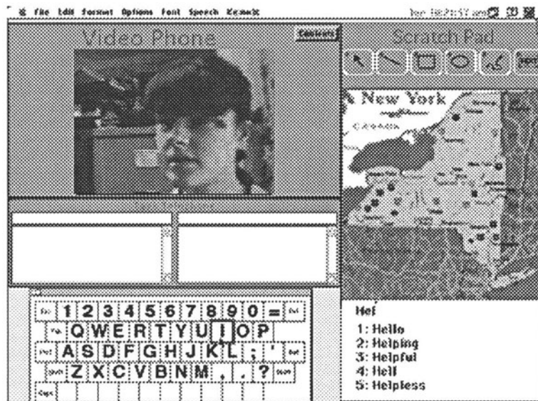
Figure 2 - Emulated Videophone with adaptations for subject E

3) Subject I: The adaptation employed for this user consisted of an on-screen keyboard and text prediction.