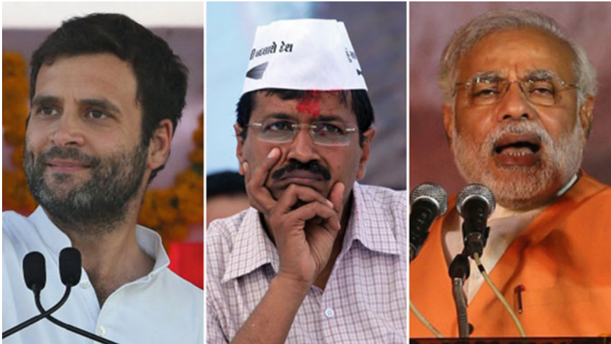
Mr Gandhi, Mr Kejriwal, and Mr Modi, candidates in the 2014 Lok Sabha election in India