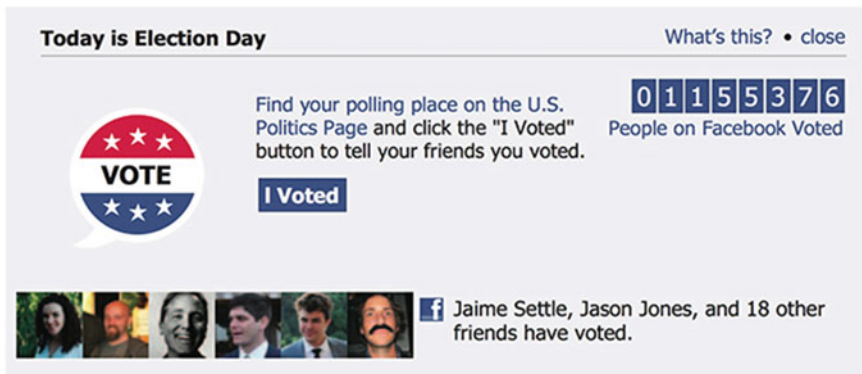
Here is the kind of prompt Facebook sent its users in the 2010 experiment

It is notable that the kinds of advertisements that could mobilize voters are ephemeral in nature. They are flashed briefly to users and then disappear. Unlike the main content of a website, which remains somewhat constant and might even be preserved by tools like the Wayback Machine (see https://archive.org/web/ ), advertisements don’t leave a paper trail. This gives companies such as Facebook complete deniability if it was ever accused of interfering in an election.