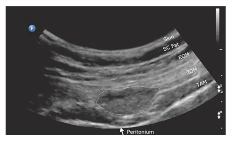
Fig. 18.4 Post-injection short axis sonogram showing the spread of the injectate in the plane between the internal oblique muscle (IOM) and the transversus abdominis muscle (TAM). Note that the TAM and the