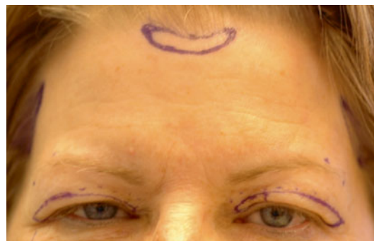
Fig. 103.1 Patient who was marked for a tri-incision trichophytic lift

Patients receive 10–20 mg oral diazepam with a combination acetaminophen-narcotic an hour before the procedure. The incision and dissection areas are first infiltrated in the subcutaneous plane with diluted lidocaine with epinephrine anesthetic (7 cc of preserved saline mixed with 3 cc of 2 % lidocaine with 1:100,000 epineph-