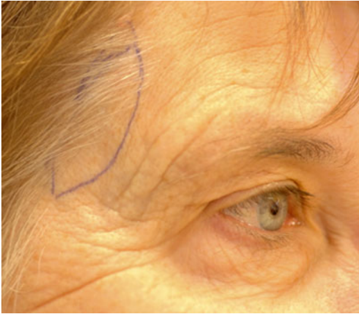
Fig. 103.2 Right temple marking for raising the lateral brow showing inferior extension to also address the lateral eyelid rhytids