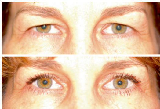
Fig. 103.4 Patient with greater lateral brow ptosis on the right side that underwent upper blepharoplasty and asymmetrical bitemporal trichophytic brow lift showing the before and after result

skin incisions can be performed through the subcutaneous dissected skin flap followed by suture placement to close the central incision and analyze the success of the lift. The suture can be easily removed and additional skin removed to achieve the desired result. Again, this can be variable depending if an upper blepharoplasty is also performed and if an internal brow elevation technique such as release of the orbital ligament has also been performed, which loosens the brow tissues and allows them to lift more easily (Burroughs et al. 2006). One benefit to this technique is the customizability as some patients may have significant brow position asymmetry preoperatively. Figure 103.4 shows a patient with more lateral hooding on the right side, so greater lift was performed on the right temporal incision than on the left. If more lift is still required, then instead of a half ellipse, a full ellipse of tissue can be removed from the scalp hair side as well, which when closed will lift the inferior temple and lateral brow tissue even further. I find fewer suture-abscess issues when utilizing monofilament suture, and most patients do well with buried 4-0 or 5-0 Monocryl. If more tension was present, then a longer lasting suture such as polydioxanone may be utilized, which is important to maintain cosmesis by avoiding scar widening. Superficial wound closure with running 6-0 Prolene should be achievable without considerable tension necessary.