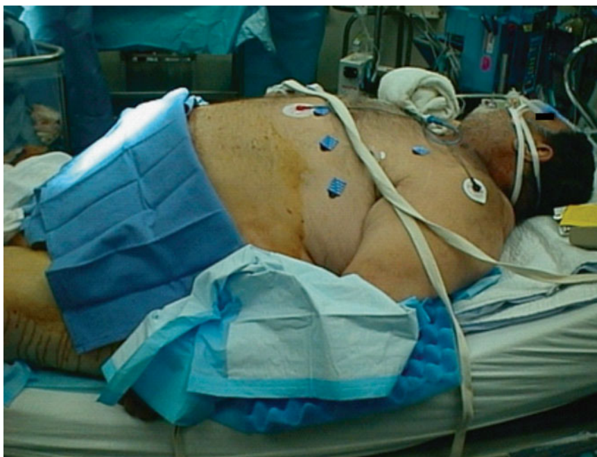
Fig. 8.3 Ramped position for tracheal intubation