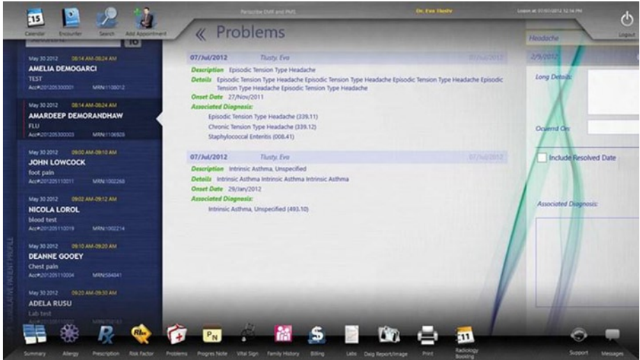
Figure 5-1. The EMR Surface app for Windows 8

EMR Surface and other high-end business apps proved that you can create extremely powerful business apps for Windows and that you don't lose any pixels on your screen by doing so.