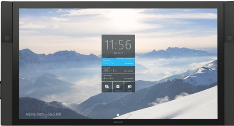
Figure 5-3. The Microsoft Surface Hub

Thus, at Microsoft's January 2015 Windows 10 update event they introduced the world to the Surface Hub (see Figure 5-3).