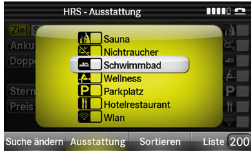
Fig. 2.4 Main screen of the conversational dialog at the beginning of the interaction