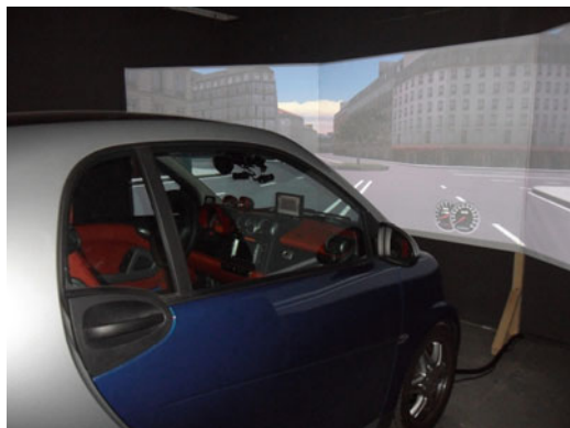
Fig. 2.7 DFKI driving simulator setup

As a primary driving task in the second study, we will use the ConTRe (continuous tracking and reaction) [9] task which complements the de facto standard LCT including higher sensitivity and a more flexible driving task duration without restart interruptions. Another requirement for our evaluation is a more fine-grained assessment of driver distraction, in terms of temporal resolution of performance metrics. In LCT, drivers are only once in a while directed to change the lanes (even with announcement) by conducting a rather unnatural abrupt maneuver, combined with simple lane keeping on a straight road in between. But real driving mostly demands a rather continuous adjustment of steering angle and speed without announcements, when the next demand will occur exactly and to which extend a reaction will be necessary. In order to receive more detailed results about the two diverse dialog strategies, we use a task that rather resembles continuous driving, like a car following task. Furthermore, we prefer an absolute ground truth of perfect