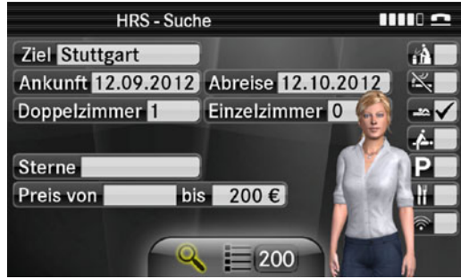
Fig. 2.6 Main screen of the conversational dialog with avatar after parameter input

The symbols on the bottom of the screen resemble the GUI states for parameter input/changes and the result list. The design of the result list screen is the same as the one concerning the command-based strategy.