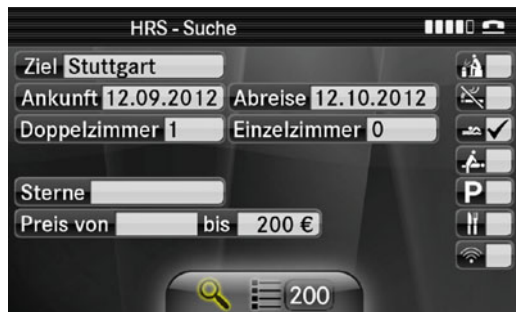
Figure 2.4 shows the main screen at the beginning of the speech interaction. The user is able to input several parameters at once. He is even allowed to already set the hotel facility filters.

After having input all required parameters (and optional parameters or filters) the system calls the HRS service and retrieves a list of hotels (see Fig. 2.5). In this GUI state the driver is able to change the search parameters, change the hotel facility filters, or sort the list by speech. There are no additional screens for presenting the available filters or for the list sorting options. The alterations evoked by speech become only visible on the main screen by changing the information displayed.