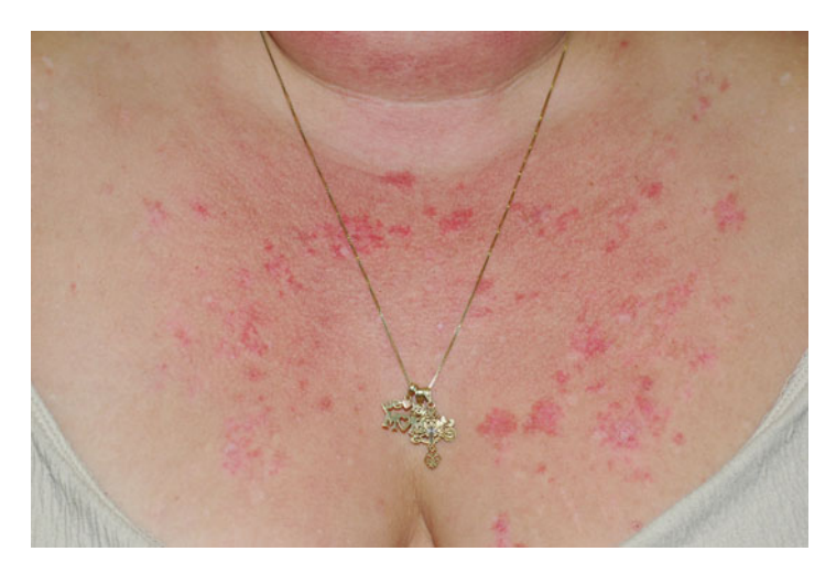
Fig. 7.1 Telangiectatic papules and plaques in a patient with subacute cutaneous erythematosus