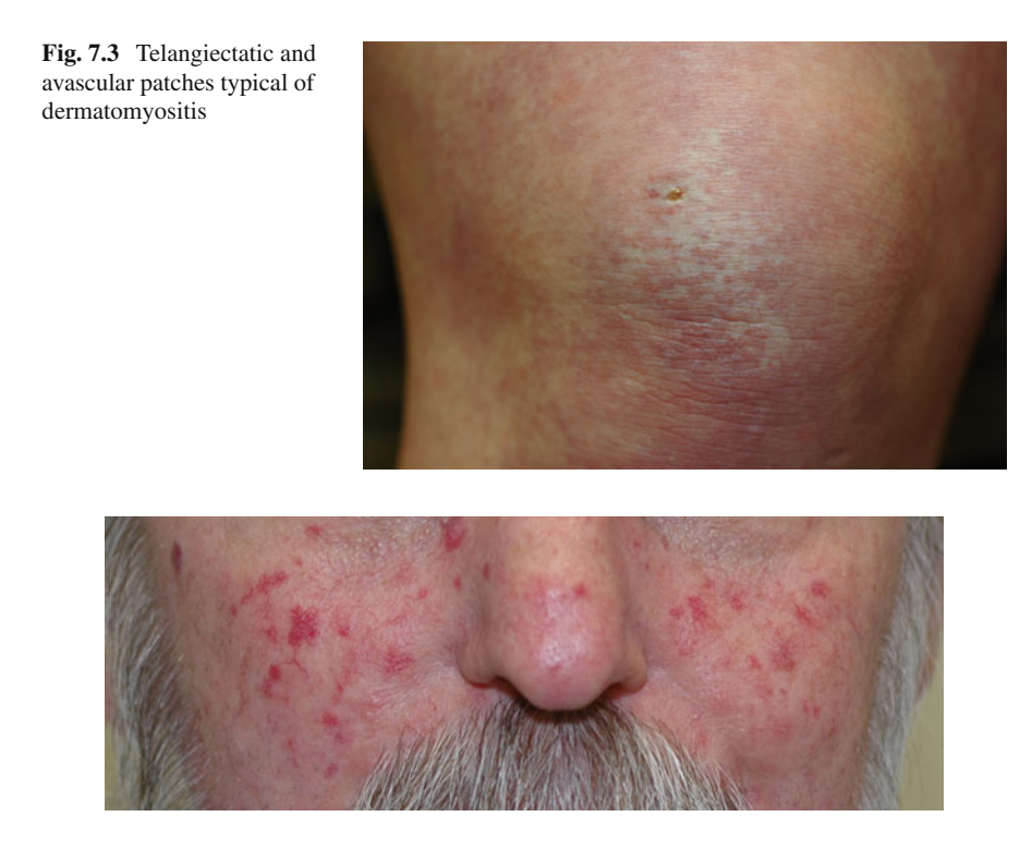
Fig. 7.4 Matted telangiectasias of systemic sclerosis

reticulate pattern (Fig. 7.3). In contrast, the telangiectasias seen in patients with systemic sclerosis are typically matted, discrete 1–5 mm lesions (Fig. 7.4). These typically occur on the hands and digits (palmar greater than dorsal surface) and the face and lips but can also be found on the chest and arms. Some data suggest that the presence of these lesions might correlate with the risk of developing pulmonary hypertension [9]. Patients with systemic sclerosis can also have discrete (non-matted) telangiectasias over the interphalangeal and metacarpophalangeal joints (Fig. 7.5), which are usually associated with prior digital ischemic ulcerations in these regions. Patients with SLE, dermatomyositis, and systemic sclerosis all can present with peri-ungual capillary telangiectasias, which are often visible to the naked eye (Fig. 7.6). The periungual lesions of dermatomyositis are often associated with tenderness, while those of systemic sclerosis are associated with acrosclerosis or puffy fingers as well as Raynaud's. Periungual telangiectasias are considered to have high specificity for the presence (or future development) of connective tissue disease.