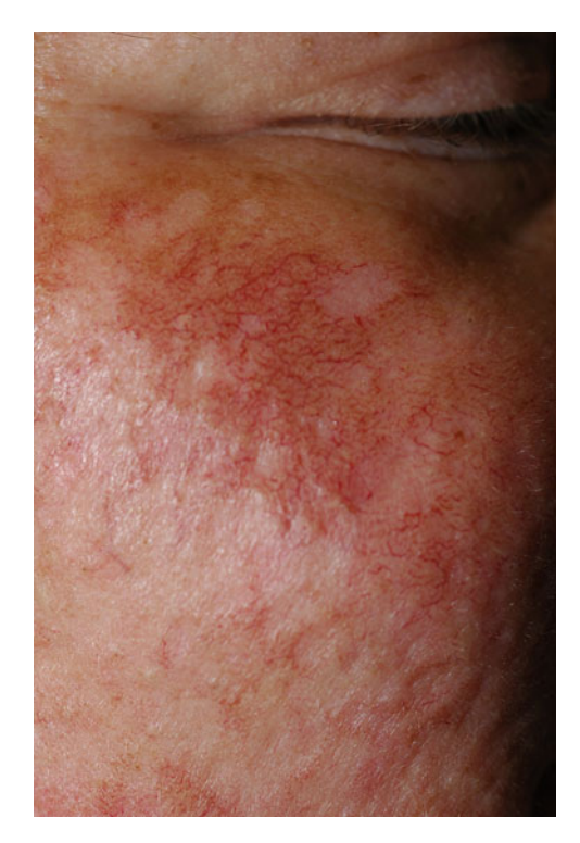
Fig. 7.2 Postinflammatory telangiectasia in a patient with dermatomyositis