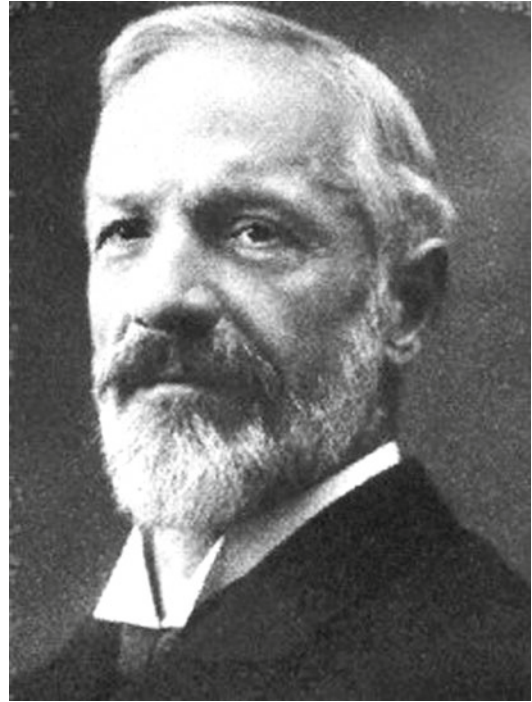
Fig. 2.2 Hans Chiari

Most of Chiari's accomplishments occurred while he was in Prague. For example, in 1877, Chiari was noted as the first to describe the features of a choriocarcinoma [1]. In 1899 and in conjunction with British internist George Budd (1808–1882), Chiari provided a clinical and pathological explanation of hepatic vein thrombosis the so-called Budd-Chiari syndrome [1]. Prior to Chiari, such a syndrome had been described but never explained to any extent. Among his other accomplishments, Chiari studied the relationship between carotid artery plaques and thrombosis. Chiari's name is also attached to the symptoms associated with aortoesophageal fistula after foreign body ingestion or gunshot wound. In 1883, Chiari probably described the first and only