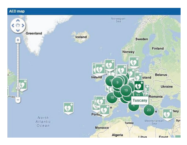
FIGURE 11.1 The map of semi-automatic defibrillators on AED4EU

parents could watch their children live 24 h a day through a mobile device [6].