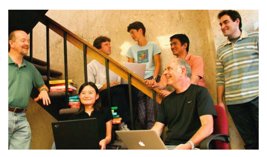
Fig. 2.1 Some of the VMT team

and teachers. The goal in development was to make the software as effective as possible to assist learning, offering students effective tools without overloading them with options. The system supports students in exploring provided math problems, discussing open-ended mathematical situations and creating chat rooms to discuss topics of their own choosing.