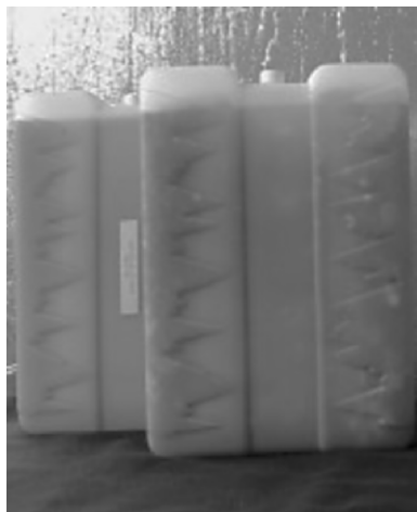
Figure 161. Rigid encapsulator

Some companies only commercialize the PCM pads (Figure 162). Such pads can be used to keep products warm (the pad must be conditioned in an oven and/or microwave oven) or cold (conditioning is done in the refrigerator) during shipment.