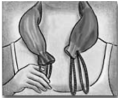
Figure 164. Hot cushion for medical purposes, (picture from Rubitherm)

One more application for medical purposes is a mattress for operating tables, which can be used to avoid the decrease of the body temperature during