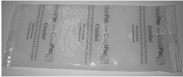
Figure 162. Soft encapsulator

PCM transport boxes have also been adopted in vacuum boxes to improve their performance (Figure 163).