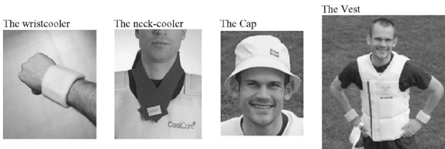
Figure 166. Wrist-cooler, neck-cooler, cap and vest with PCM for thermal protection

Heat can be a problem for professional athletes both in training and at competition. Heat can also be a problem for other people like elderly people, people with some diseases and children. If the body-temperature can be reduced most people would feel more comfortable, perform better, be able to keep concentrate better and for a longer time and the risks of dehydration and fatigue is reduced. New products to address this problem were developed, such as wrist-cooler, a neck-cooler, a cap and a vest (Figure 166). All these