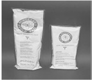
Figure 165. Rubitherm cold product for cooling therapy

long operations, or during operations of burned people. The mattress would be heated up electrically before its use (the PCM would be with a melting temperature of about 37 °C), and it would release the heat during the operation. This application is being tested as a prototype.