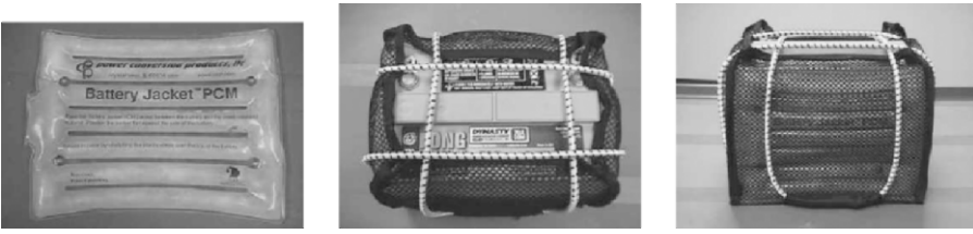
Figure 167. Left, PVC packet with TEAP PCM; center, top view of Battery Jacket; right, side view of Battery Jacket

products are being used by more and more athletes and professional workers in extreme conditions.