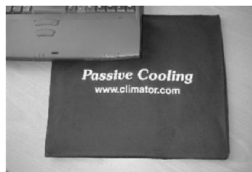
Figure 168. PCM pad for laptops

A passive cooling system for communications equipment has been developed by Climator AB, starting with a collaboration with Ericsson Telecom. This work lead to the production of ClimSel Cooling Systems that nowadays have been in operation for several years, with 100% function and no