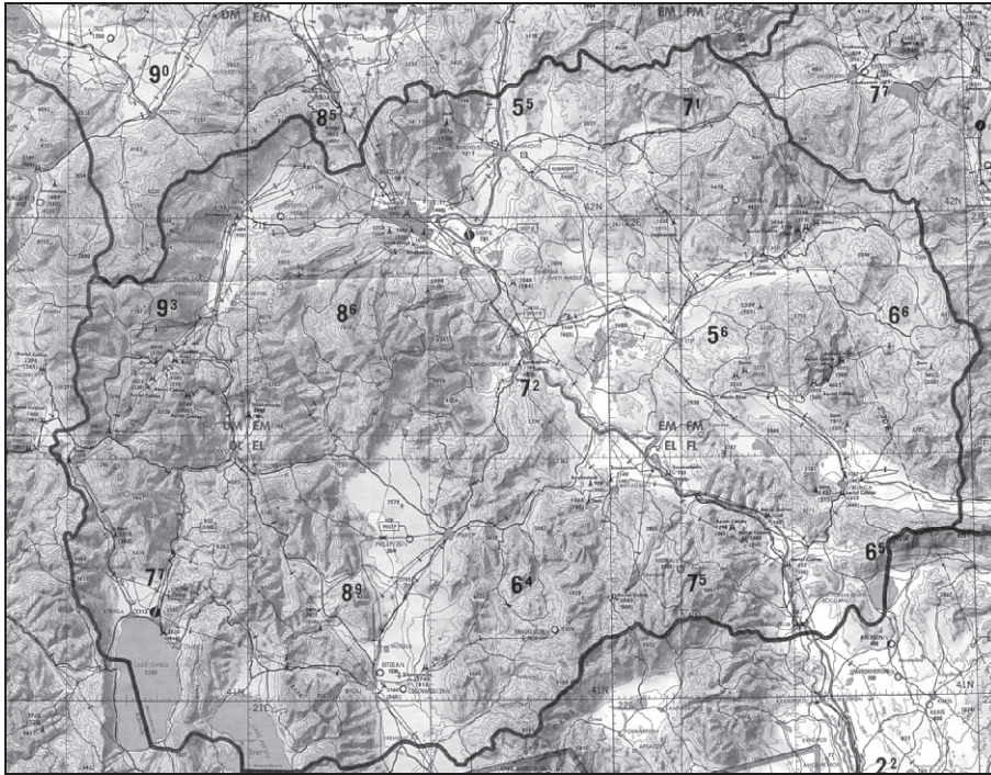
Figure 1. The Republic of Macedonia: an aeronautical map.

Magnetic observers strive to measure those quantities with an accuracy of one second of arc for D and I and one tenth of a nanotesla for F. This high accuracy is necessary to ensure correct extrapolations when forecasts are made, a procedure which tends to amplify the observation errors.