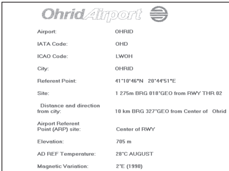
Figure 2. Extract from the web-page of Ohrid airport (2005).

When consulting the web-pages of the Macedonian airports, we looked for magnetic declination information. Skopje Airport did not give this data while the airport in Ohrid gave data which is 15 years old (obsolete) as seen in Figure 2.