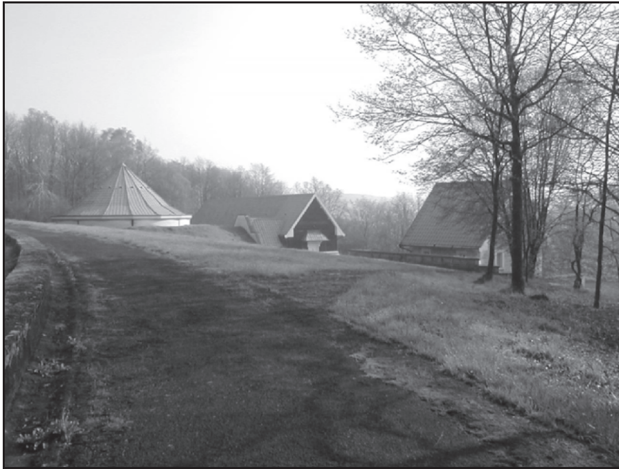
Figure 3. A protected site: the geomagnetic Observatory of Dourbes, Belgium.

The geomagnetic community has at hand a set of about 150 magnetic observatories in Europe and worldwide, where the geomagnetic field is measured on a continual basis, often at a rate of one full vector of the field at 1 sample per minute or faster. These sites are carefully protected from magnetic perturbations, so as to ensure that they observe the natural magnetic field and not one perturbed by cultural or technical noise. This is the same unperturbed field which will be measured by the compass of an aircraft flying aloft. Many of these observatories belong to the INTERMAGNET network, offering their data in near real-time on the INTERNET. Figure 3 shows a protected magnetic observatory site. Note that the observatory buildings are made exclusively of non-magnetic materials like wood, copper, white sandstone, and nonmagnetic concrete. It is worth mentioning here that the Republic of Macedonia is contemplating the construction of a magnetic observatory soon.