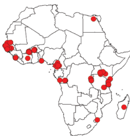
Figure 4. Locations where EIR and (for a sub-set) biting rate have been recorded (derived from Hay et al. (2000))

Our analyses were designed to indicate general differences in spatial structure and are not exhaustive (a variety of lags and bounding regions could have been tried) or complete (for instance there are methodological inconsistencies in the entomological measurements, see Hay et al. (2000)).