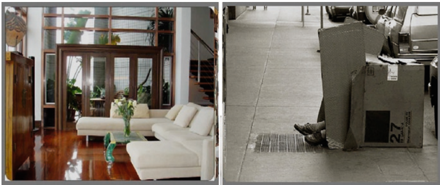
Fig. 2.3 Vertical display with pairs of images for issue: shelter (out of balance, bins 5 & 1)

The display engine uses the current value of the total balance index (described above) in a random process controlled by a bell distribution curve to select pairs of images from the five bins. The center of the curve is determined by scaling the data from the total balance index ( -10 to +10 ) to a floating point index from 1 to 5. The deviation of the bell curve is set so that when the control index is at x.0 the engine presents images only from that bin. For example, if the balance index is 3.5 , the engine will display images from bin 3 and bin 4 with equal probability. To select pairs of images that represent the two factors or sides of twin-pan balance schema, the second image is selected using a mirror index derived by subtracting the balance index from the maximum for the index. For example, a balance index that would be