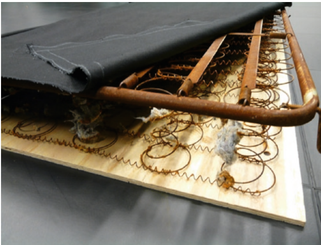
Fig. 2.2 Springboard input platform made from a crib spring, a board and black cloth

The spatial and body balance parameters for the input space are determined using a camera vision blob tracking and analysis system developed in the Max/Jitter programming environment. The user stands in front of a black background on the black