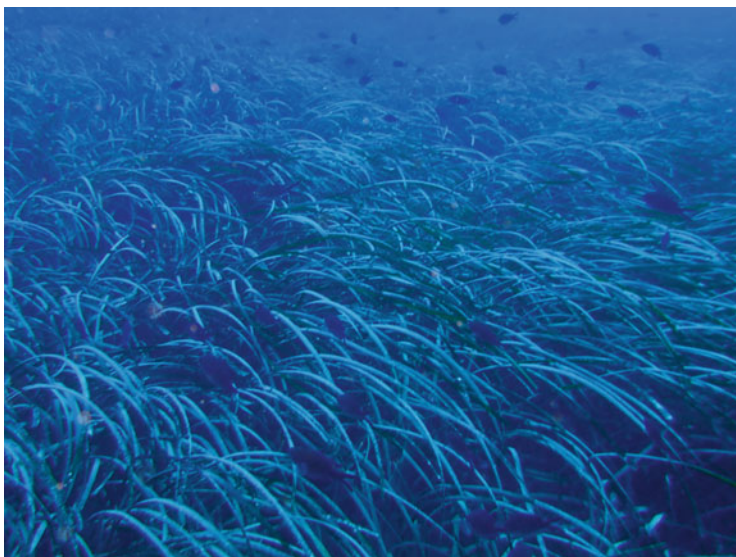
Fig. 2 Meadows of Posidonia oceanica (source: S. Petović)