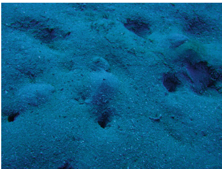
Fig. 7 Sandy-muddy substrate

Therefore, in these zones one can identify very well-developed “barren” community types (Fig. 6).