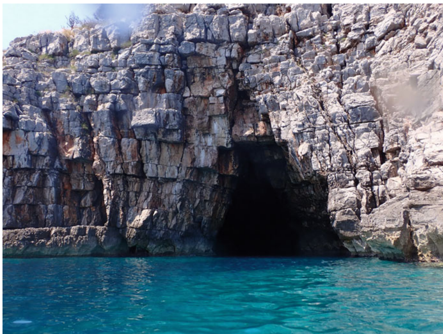
Fig. 4 Marine cave