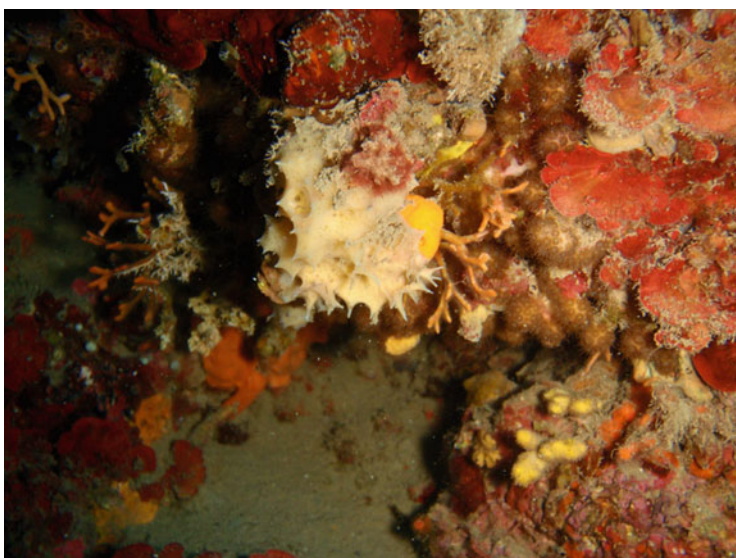
Fig. 3 Coralligenous habitat

On the hard bottom in the upper infralittoral zone extends a community of photophilic algae (Fig. 5), while in areas characterized by overfishing, a large number of the urchins Paracentrotus lividus and Arbacia lixula can be found.