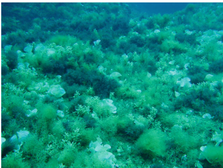
Fig. 5 Biocoenoses of photophilic algae in the upper infralittoral zone