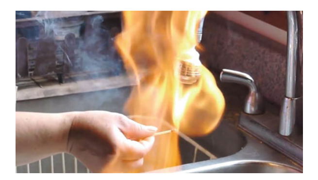
Fig. 3 Burning of drinking water as a result of shale gas seeping into aquifers

Based on the Clean Water Act of 2005, the ecologists succeeded adoption of the ordinance obliging shale gas companies to make public the formulation of chemical additives and to reduce the chemical load on the region's environment.