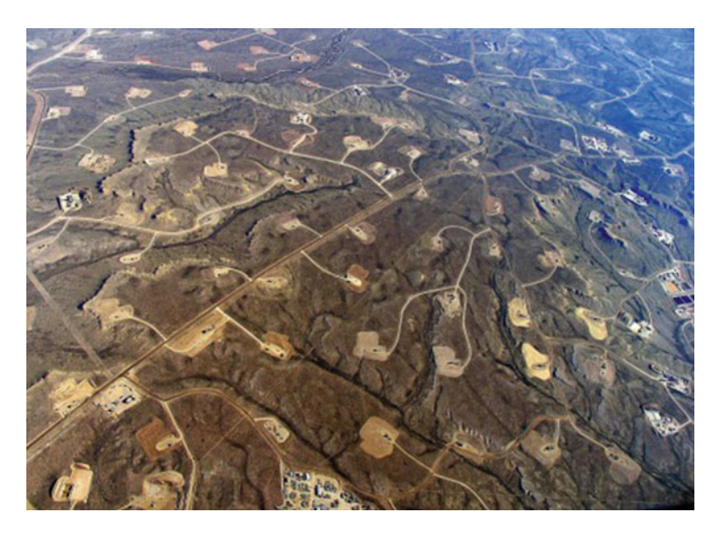
Fig. 2 The ecological impact from shale gas extraction operations on the landscape (Wyoming's Jonah Field, USA)

non-shale formations. Penetration into such formations of fluids containing chemical agents will increase the polluted area.