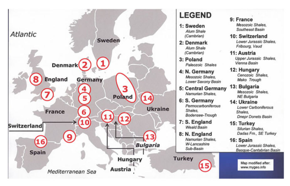
Fig. 1 Shale gas opportunities in Europe (http://www.netlabgmbh.de/ShaleGas%20Europe.jpg)

recoverable resources of shale gas make 5.3 tcm. Based on such data, there were made assumptions about the opening opportunities for Europe to change drastically its gas market structure having reduced significantly the dependence on hydrocarbon supply from Russia, Near East, and North Africa. Thus, in the recent years, the gas consumption in the European countries made around 550 bcm. After respective estimates, it was concluded that the shale gas reserves were sufficient to meet the needs of Europe for 30–35 years.