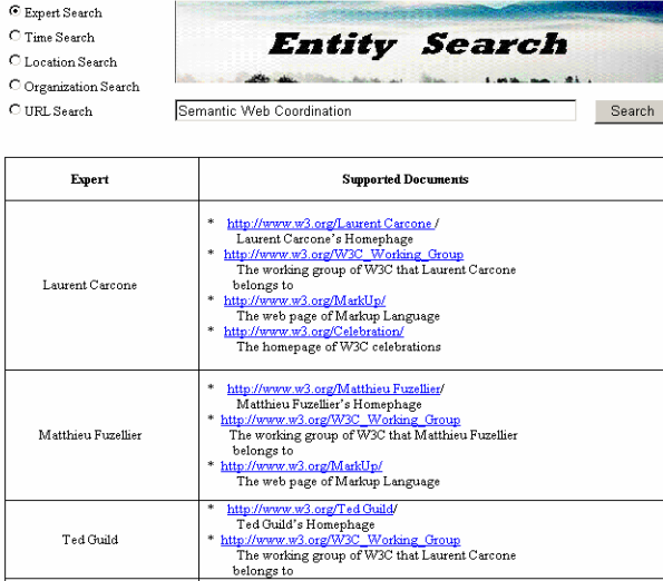
Fig. 1. An illustrative interface of entity search system

topic of the query). In practice, an association presented in a document can be bogus; however, we do not consider the problem in this paper.