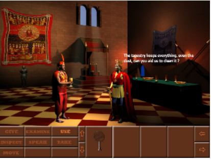
Fig. 7. (a) Snapshot of the safety regulations videogame; (b) Snapshot for Hall of the Kings , a little educative game developed by reusing assets provided by CNICE