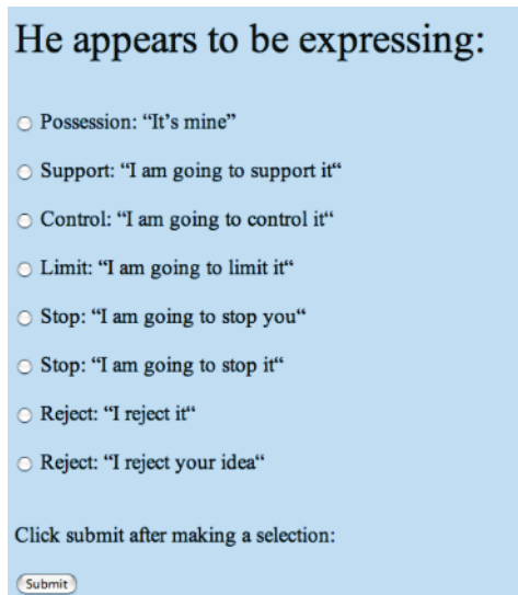
Fig. 1. Questionnaire

After each animation, they were then provided a forced choice questionnaire. See Table 2. The authors broke the interpretation of “Stop” into two variants, Stop you and Stop it. Similarly, “Reject” was broken into two variants of Reject It and Reject