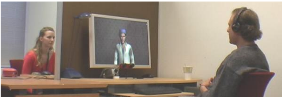
Fig. 2. Experimental setup

People can be socially influenced by a virtual character whether or not they believe it represents a real person (Nass and Reeves 1996) although there can be important differences depending on how the situation is framed. In this study, we use a cover story to make the subjects believe that they interact with a real human. The participants are told that the study evaluates an advanced telecommunication device, specifically a computer program that accurately captures all movements of one person and displays them on the screen (using an Avatar) to another person. According to the cover story, we were interested in comparing this new device to a more traditional telecommunication medium such as video camera, which is why one of the participants was sited in front of the monitor displaying a video image, while the other saw a life-size head of an avatar (see Figure 2).