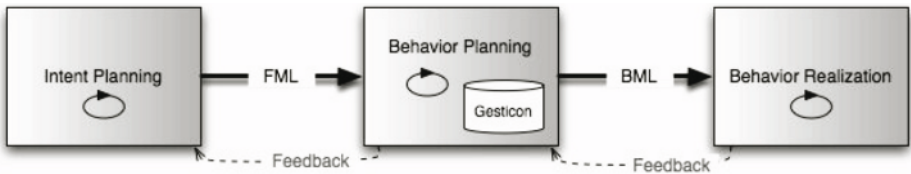
Fig. 1. SAIBA framework for multimodal generation

The generation of natural multimodal output requires a time-critical production process with high flexibility. To scaffold this production process we introduced the SAIBA framework (Situation, Agent, Intention, Behavior, Animation), and specify the macro-scale multimodal generation consisting of processing stages on three different levels: (1) planning of a communicative intent, (2) planning of a multimodal realization of this intent, and (3) realization of the planned behaviors. See Fig. 1 for an illustration of the SAIBA framework.