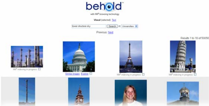
Fig. 1. Initial search using keywords (query: ‘tower structure sky’)

The search engine is implemented within the JavaServerPages framework and is served using Apache Tomcat 1 . Figure 1 shows the result of a query ‘tower