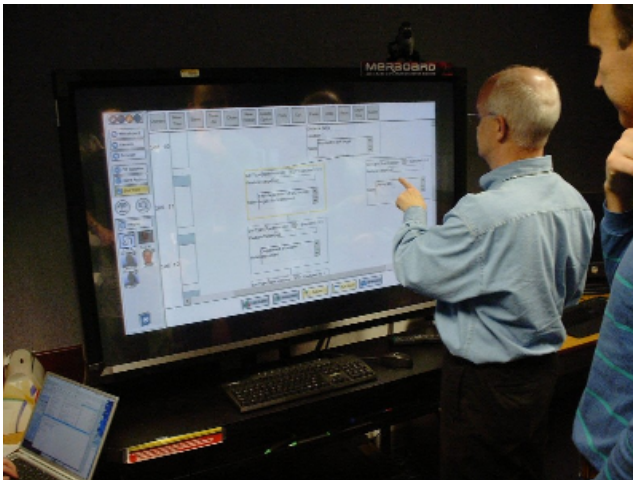
Fig. 2. Scientists collaborating on a plan using SolTree

Tool structure supports early collaborative work: Most of the LTP scientists appreciated SolTree’s ability to keep track of all of the possible branches and options,