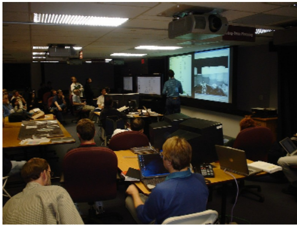
Fig. 1. MERBoards, projectors, laptops, and workstations in the work environment

Unlike many other large interactive display systems, MERBoards were deployed to support specific, time-dependent work tasks of real users (Figure 1). MERBoards were integrated into a fast-paced, round-the-clock and often hectic work schedule to support necessary tasks; this is in contrast to many systems that have been deployed primarily in research or test environments as supplemental support for collaboration, rather than a primary medium for accomplishing work tasks. Additionally, many MERBoards were deployed in parallel, with 18 of the displays in use at JPL during the initial months of the mission, whereas other research prototypes have often been single instances of the technology or deployed in small numbers. Finally, unlike many other large display groupware systems, MERBoard has been integrated into a work environment that contains many display alternatives, including several other large display options. All of these factors led us to investigate not only how users interacted with the MERBoard, but also address the greater issue of the role of interactive large display groupware within highly dynamic, complex display ecologies.