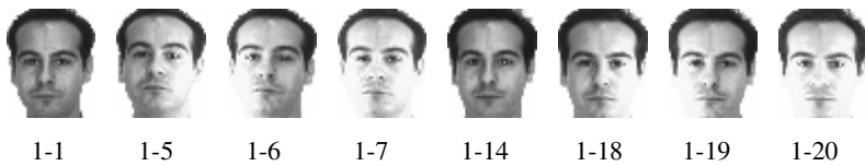
Fig. 2. The training and testing samples of the first man in the database, where, (1-1) and (1-14) are training samples, the remaining are testing samples

We intend to test our idea on AR face database, which was created by Aleix Martinez and Robert Benavente in CVC at the U.A.B [7]. This database contains over 4,000 color images corresponding to 126 people's faces (70 men and 56 women). Images feature frontal view faces with different facial expressions, illumination conditions, and occlusions (sun glasses and scarf). The pictures were taken at the CVC under strictly controlled conditions. No restrictions on wear (clothes, glasses, etc.), make-up, hair style, etc. were imposed to participants. Each person participated in two sessions, separated by two weeks (14 days) time. The same pictures were taken in both sessions. Each section contains 13 color images. Some examples are shown in web page ( http://rv11.ecn.purdue.edu/~aleix/aleix_face_DB.html ).