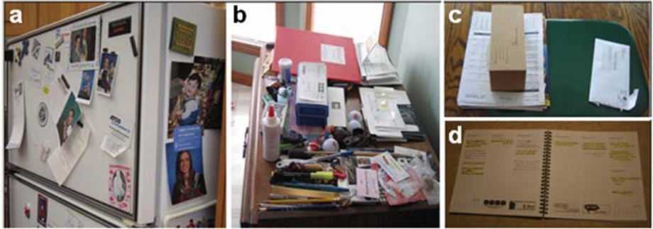
Fig. 5: Spatial Ownership

We found four main subtypes of location ownership within homes: public spaces, public subset spaces, personal spaces, and private spaces. Public spaces are those owned by everyone in the home. For example, the main house phone or the fridge door are usually considered public spaces, and messages affixed or near it may be for anyone. Figure 5a shows a fridge door used as a public space, where everyone can see it, place items on it, and interact with those items.