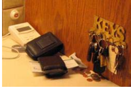
Fig. 3: Envelopes to be mailed placed with keys