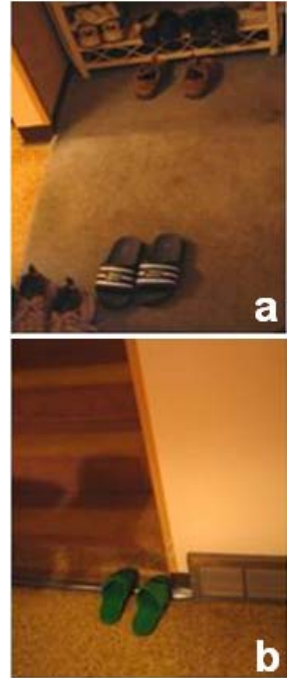
Fig. 6: Slippers indicate presence and location.

Figure 6 shows how one of the participant households evolved a particularly rich system for handling awareness information. Each member of the household would wear different colored slippers while in the main floor of the house, as it was tiled and cold on bare feet. These slippers would be left in the main entryway (Fig. 6a) when the wearer was not in, or at the foot of the stairs when they were upstairs in the carpeted area of the home (Fig. 6b). In this way, family members always knew who was home, and their general location in the house. The presence of an object in a routine location can provide information to household members.