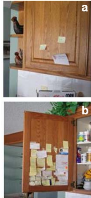
Fig. 4: Information dynamics

For example, in one household, members left phone messages as sticky notes on the outside of a cupboard door above the main household phone (Fig. 4a). After dealing with a message, the member may throw it out. However, if the member needs to keep the message, e.g., contact information that one does not wish to lose, it may be placed on the inside of the cupboard door for a kind of longer term common archive (Fig. 4b). The household knows that messages on the inside of the door are there for storage, while those on the outside still need to be dealt with. In this way, locations provide a sense of the dynamics of the information.