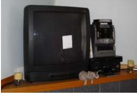
Fig. 2: Urgent message from mother to son