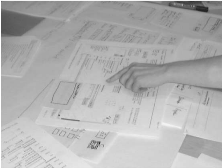
Figure 2.2 Low-fidelity prototyping tools were used as these were the most convenient for visualizing the future use situation without limiting the design space

Halfway through the project all participants were very satisfied with the activities so far and the results achieved. The project was committed on all levels to UCSD. The principles communicated the essentials of UCSD very well.