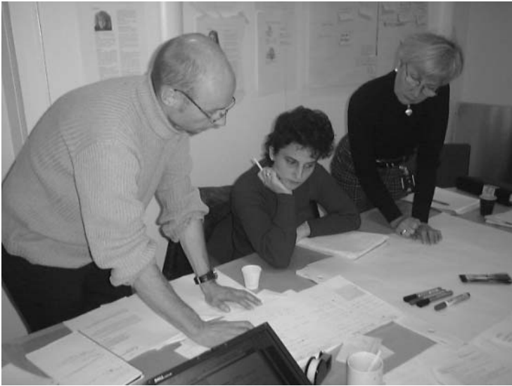
Figure 2.1 Collaborative prototyping in which the usability designer facilitates the users' production of mock-ups

of the future system as a basis for a negotiation on the most appropriate design of the system.