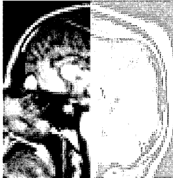
Fig. 2. MRI scan showing epidural hematoma with significant mass effect.

lateral ventricle and a midline shift. The hematoma is limited in extent by the sutural dural attachments. Excessive linear (translational) and/or angular (rotational) forces delivered to the cranium and transmitted to the brain may induce an patient' unconscious state, although, EDH is often not associated with primary head injury unlike subdural hematomas. Therefore, from a clinical perspective, a patient with EDH may initially appear asymptomatic until the hemorrhage reaches a critically large size excessively compressing underlying brain tissues.