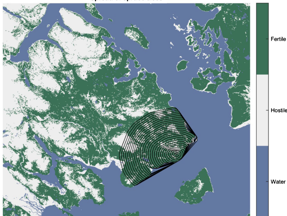
Fig. 3 Emerging mathematical approaches for simulating population spread across heterogeneous landscapes offer substantial potential for landscape ecology, making possible highly computationally efficient projection of species range dynamics over large spatial scales. This is an example where the spread of spruce ( Picea ) trees at Glacier Bay, Alaska, is simulated. We simulate a 2D IDE using the adaptive mesh refinement algorithm from [193]. We assume a piecewise-linear growth function where the landscape-dependent population growth rate, r_0(x) , is constant below the carrying capacity, K (assumed, without loss of generality, to be 1). That is f(N_t(x)) = \min(r_0(x)N_t(x), K) , where N_t(x) is

the population density at generation t and location x , and r_0(x) is 15 \text{ years}^{-1} on fertile land [195] and zero elsewhere. We also assume a 2D exponential kernel with a mean dispersal distance of 85 m. The landscape suitability map was calculated from the National Land Cover Database 2011 [196]. The figure shows areas of water, hostile, and fertile land. The contours depict predicted annual maximal spread of the spruce trees from the initial location. For the given parameters, the IDE gives a spread rate of 367 \text{ m year}^{-1} , which closely matches empirical estimates [197]