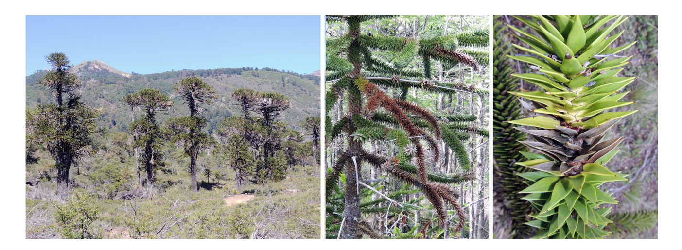
Fig. 4 Decline of Araucaria araucana in Chile: left, crown symptoms on adult trees; centre, dieback of branches associated with girdling cankers; right, cankers on branches caused by Pewenomyces kutranfy