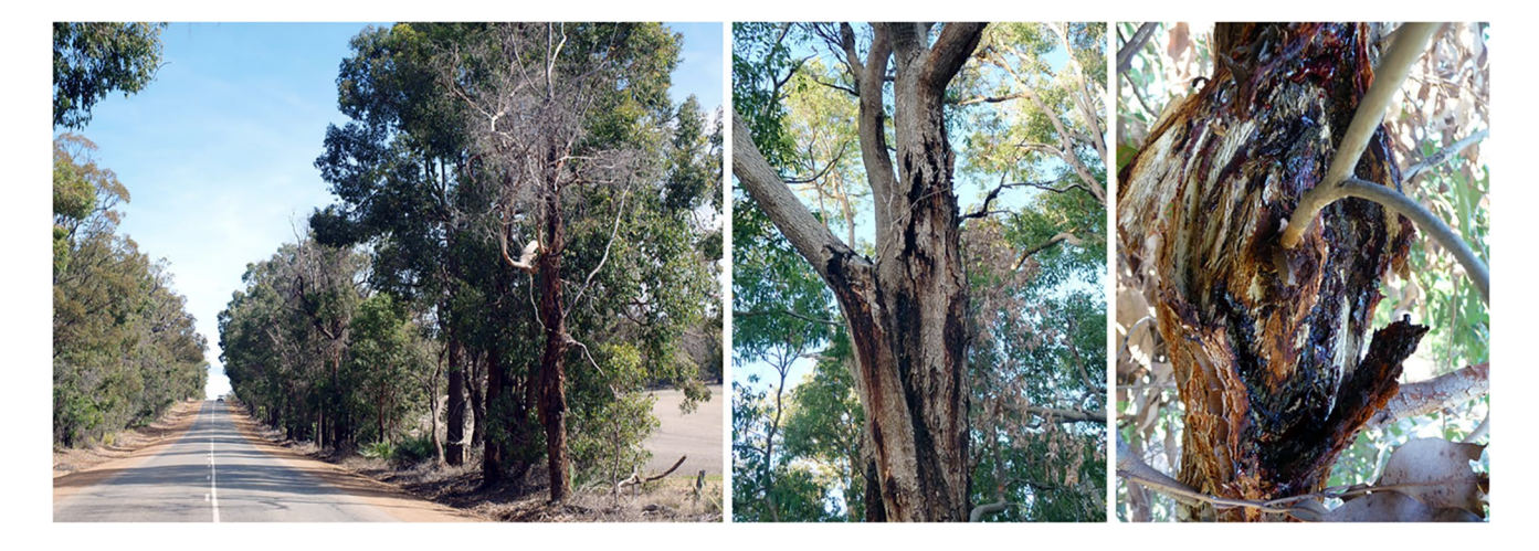
Fig. 1 Quambalaria coyrecup causing cankers on Corymbia calophylla. Left, leading to branch dieback and death of roadside trees; centre, extensive perennial cankers; right, sporulation of Q. coyrecup on the canker surface

the decline of Araucaria araucana in South America as an example, we recommend an experimental approach that could be applied to understand the dynamics of emerging forest pathogen outbreaks. We highlight the need for this approach to consider both temporal and multi-spatial scales.