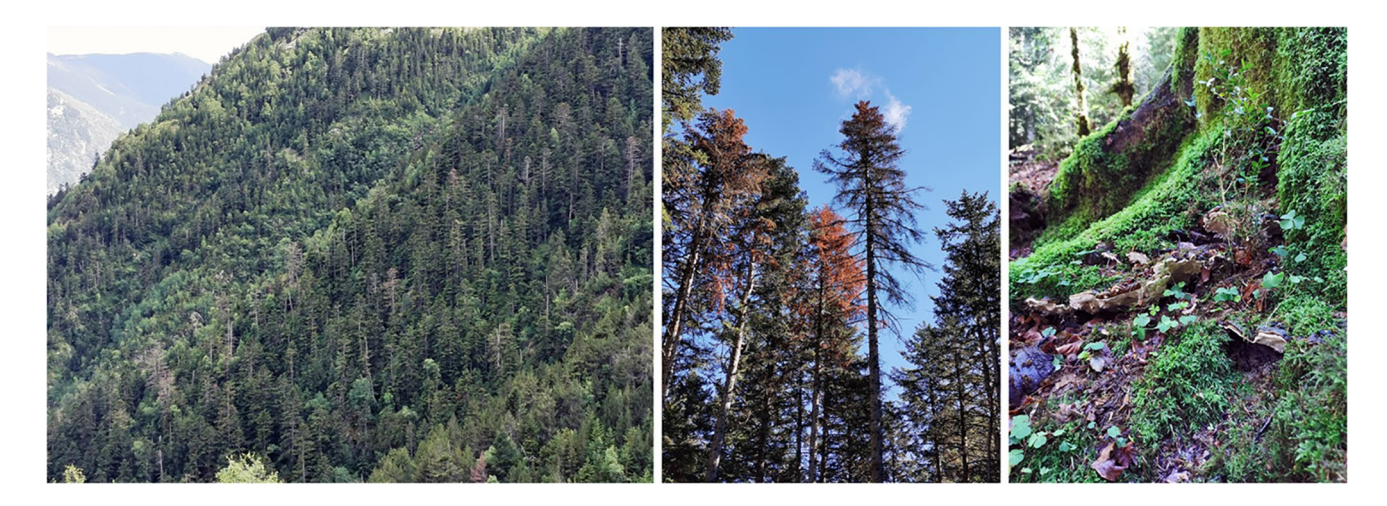
Fig. 2 (Left) Decline of silver fir ( Abies alba ) in the Pyrenees. (Centre) Leading to defoliation and tree mortality. (Right) Mortality is associated with a widespread presence of root rots such as Heterobasidion abietinum amongst other pathogens

beneficial mycorrhizal fungi have lower richness and diversity in edge habitats in comparison to forest habitats [35•].