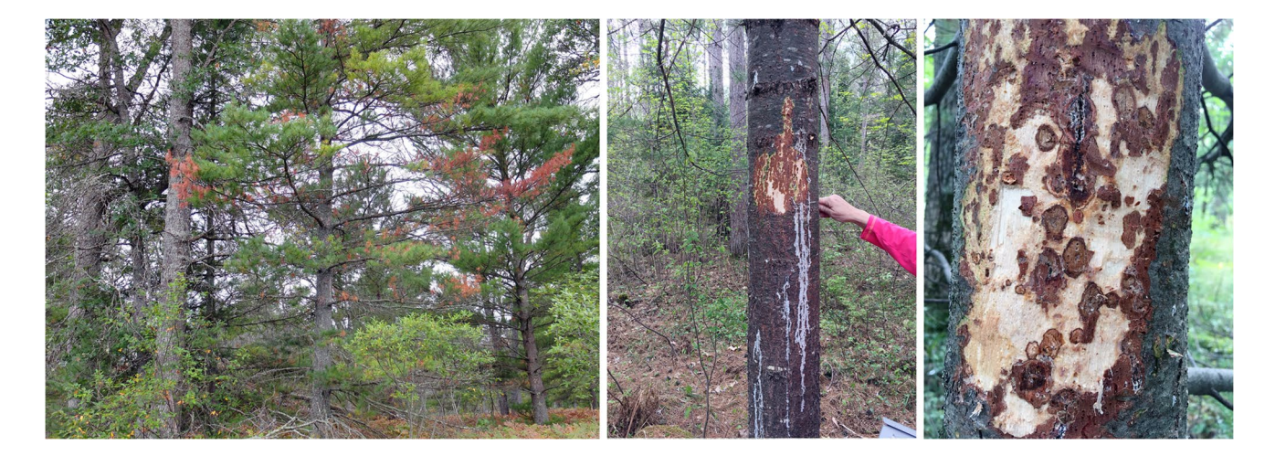
Fig. 3 Caliciopsis canker symptoms on Pinus strobus (eastern white pine): left, reddish flagging branches; centre, resinosis indicative of numerous cankers; right, numerous, small and sometimes cracking