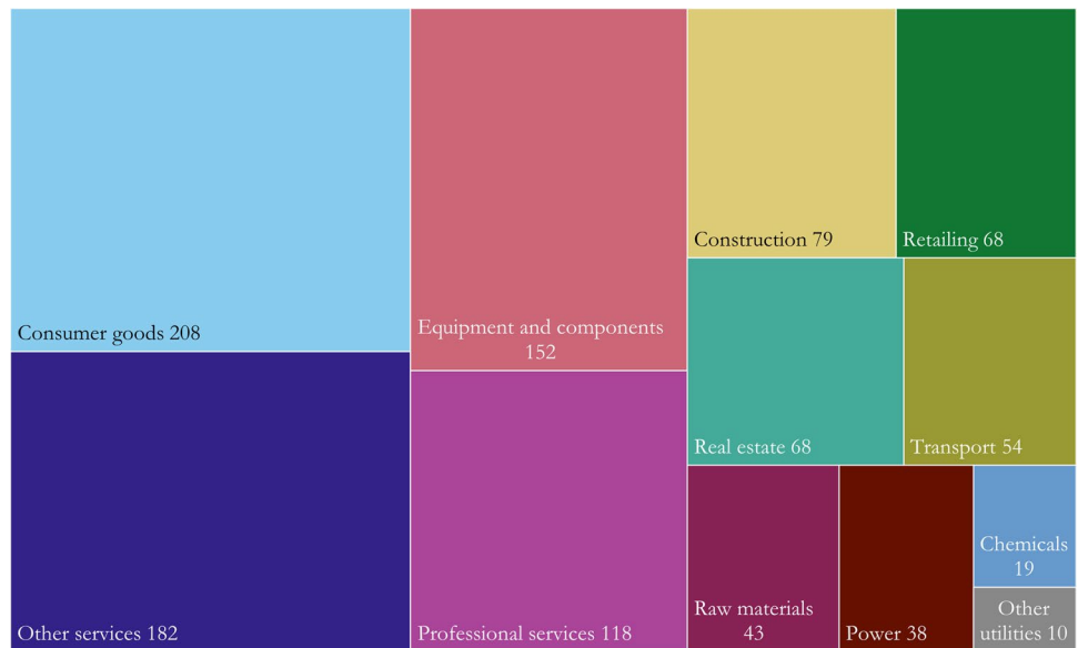
Fig. 3 Sectoral distribution of 1039 companies with approved SBTs through November 2021. Data extracted from SBTi dataset on 2 December 2021 [37]. Companies who have only committed to setting SBTs are not included. See Table 2 in the Appendix for a translation between SBTi sectors and the sectors used here

setting SBTs are not included. Two companies in Bermuda are not shown. Map created using Datawrapper [38]