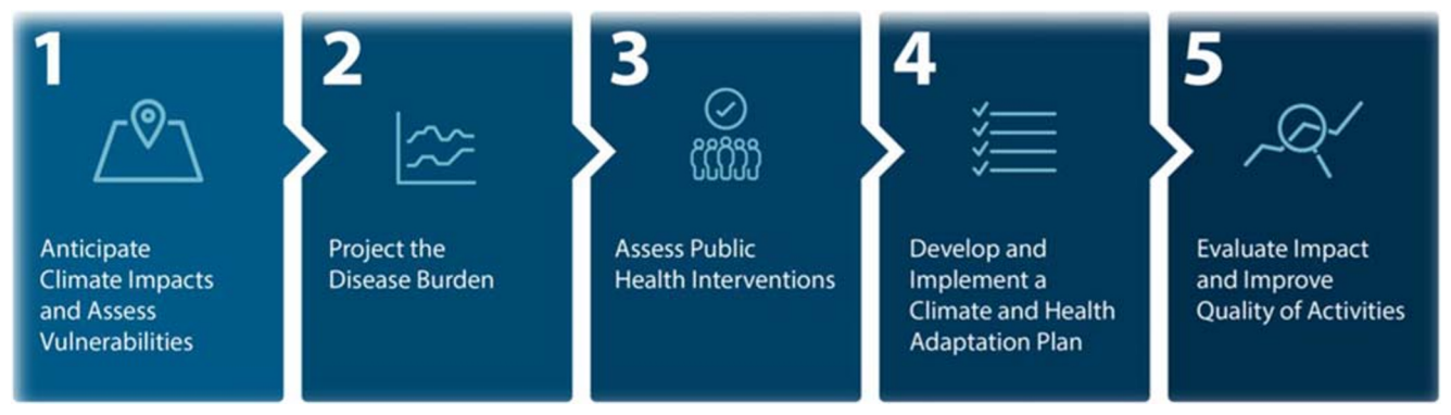
Fig. 1 The five-step BRACE framework

Small grants from CDC-funded CRSCI states to local jurisdictions have been another effective method of supporting local climate and health adaptation efforts. While not a requirement, several states receiving CDC funding have distributed competitive sub-grants to counties and cities within their states. These grants facilitate capacity building, forging partnerships with entities outside of health departments, incorporating climate change information into existing programs, and developing adaptation plans, while streamlining collaboration across multiple levels of government. Surveys of grant recipients found increases in knowledge, engagement with diverse