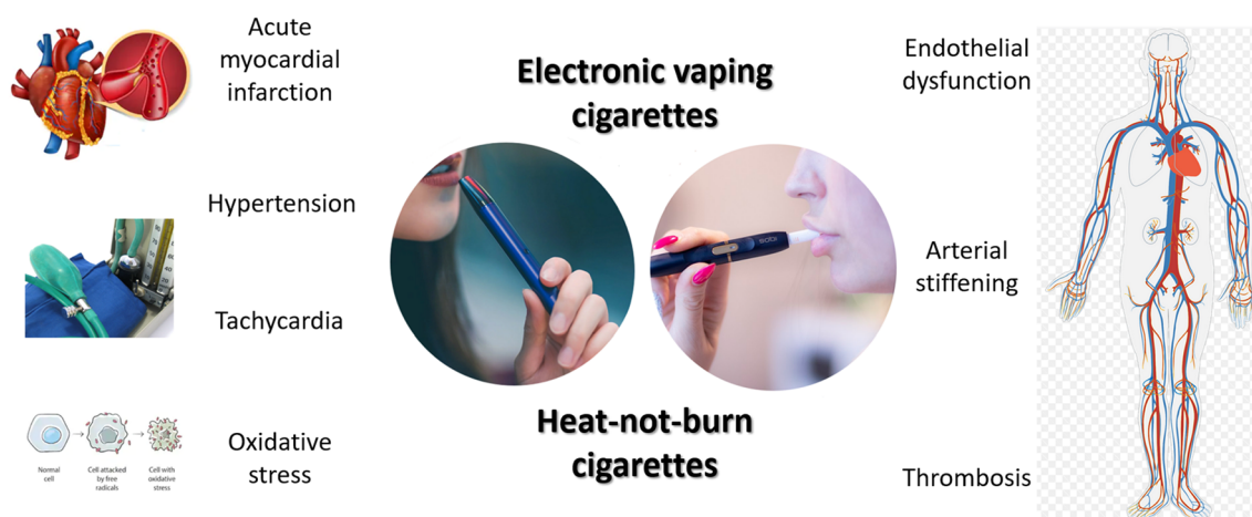
Fig. 1 Key adverse cardiovascular effects of electronic vaping cigarettes and heat-not-burn cigarettes

mechanisms involved in EVC toxicity are needed, exploring for instance microRNA, inflammatory cascade, autophagy, apoptosis, and regeneration [36–38]. Observational studies on large samples are needed to accurately gauge the short and long-term risks of EVC in apparently healthy subjects and in patients with cardiovascular disease [39]. In addition, randomized trials, from small-sample speculative ones to large pragmatic studies, are direly needed to ensure that the place of EVC in current clinical practice is correctly defined [40]. Indeed, our premise is that EVC should be considered as an over-the-counter medical intervention suitable to support chronic smokers in their journey to eventual cessation. Accordingly, only a comprehensive evidence platform, hopefully summarized in a formal network meta-analysis, will be able to precisely define the place and role, if any, of EVC in a comprehensive approach aiming at smoking cessation and harm minimization [41]. Pragmatically, and based on our personal and professional experience, we may suggest a stepwise use of EVC and HNBC with the eventual aim of total and