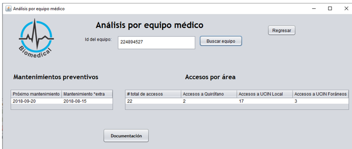
Fig. 5 Analysis interface by equipment

Thanks to the implementation of this system in this test, the medical equipment was easily found in the hospital during his preventive maintenance date, because the inventory keeps every updated record. After the use of our system, the biomedical department sustains a correct compliance of the