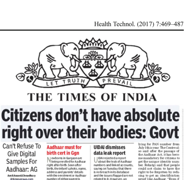
Fig. 3 Front Page Story - Times of India 3 May 2017. Attorney General of India Notified The Nation's Highest Court That Indian Citizens Do Not Have The Right To Self-Determination.

On 3 May 2017, in presenting arguments before the court related to the Aadhaar Program, the Chief Law Enforcement Officer, the Attorney General of India (AG) shocked the world when he declared before the highest court in the land that the Citizens of the nation – widely acknowledged to be the world's largest democracy, "do not have absolute rights over their own bodies," (See Fig. 3) in essence - declaring that the Government of India could lay claims to "one's self," on demand. The AG, however, did not elaborate then, just how, when, or under what specificities, such demands could be presented before a citizen by the State. However, in this author's view, the AG has struck a match, which is sufficient to spark a Constitutional Crisis.