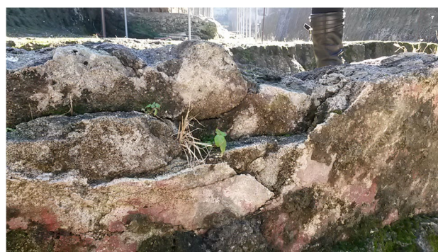
Fig. 3 Plastered wall of an archaeological site affected by biological colonization

Chemoorganotrophic fungi are often present on stone surface, and they can penetrate into the rock material (Krumbein