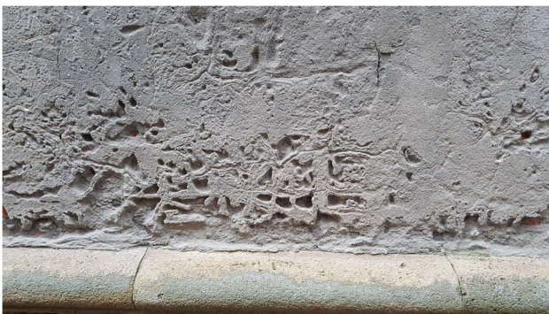
Fig. 4 A plaster affected by Flos Tectorii

It would appear also that the kinetics of the phenomenon might be related to the microclimate conditions, which favour recurrent high relative humidity. The proximity to the sea seems to be the major risk factor for the advance of this type of degradation, with faster kinetics under more aggressive environmental conditions.