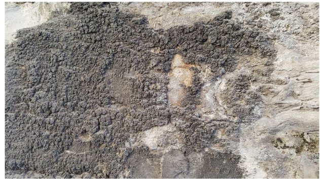
Fig. 2 Black crust on a plastered wall. Detachment phenomena are also visible

The other atmospheric components, such as metals and metal oxides, act as catalysts in the sulphating reaction (Barca et al. 2014). The formation of black crusts leads to a detachment of the degraded layer, because these newly formed materials have different properties with respect to the substrate in terms of texture and porosity, and then the adhesion between them is compromised, that is why black crusts are often observed together with detachments (Fig. 2).