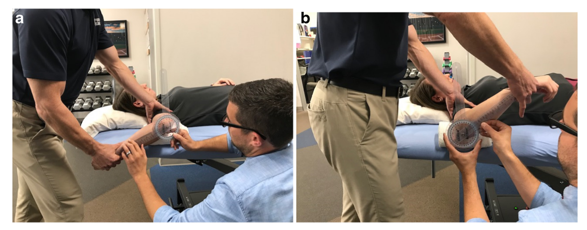
Fig. 1 a Shoulder passive external rotation goniometric measurement. b Shoulder passive internal rotation goniometric measurement