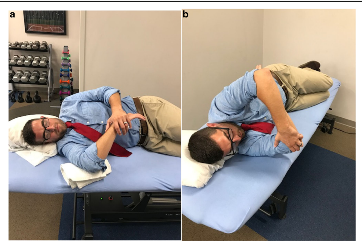
Fig. 3 a Self-modified sleeper stretch. b Self cross-body stretch