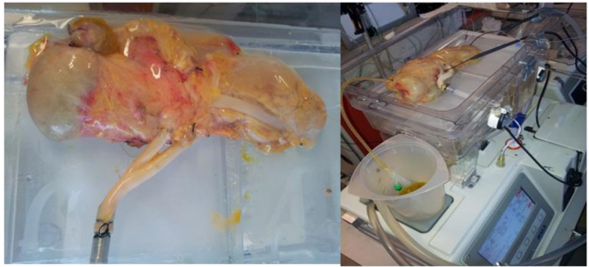
Fig. 2 Photo of human pancreas graft undergoing hypothermic machine perfusion and subsequent normothermic reperfusion viability assessment. (Reprinted from Hamaoui et al., with permission from Elsevier) [48•]

machine (Waters Medical System, Waves). The extended low-pressure HMP was associated with an improving resistance index during perfusion, minimal subjective visible oedema, no histological evidence of cellular oedema or necrosis (compared with SCS control pancreata where patchy necrosis was evident), and positive immunohistostaining for insulin and glucagon in islets in HMP-preserved pancreata.